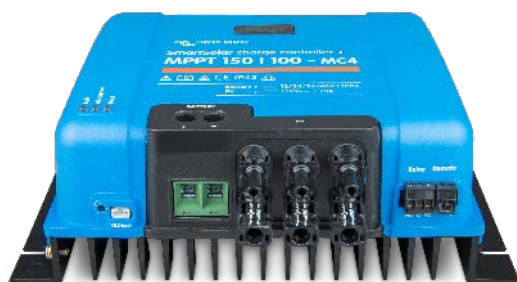
Solar Charge Controller MPPT 150/100-MC4 without display