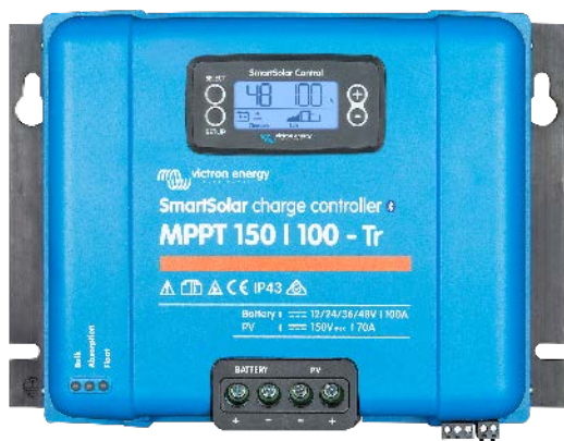
Solar Charge Controller MPPT 150/100-Tr with pluggable display